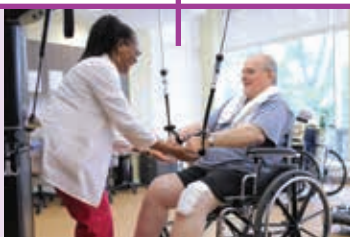
New state-of-the-art Rehabilitation Center cares for the community.