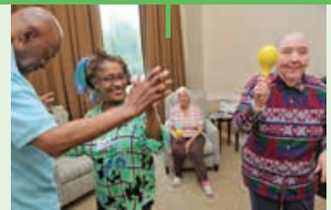
Adult Day Services is offered on Wartburg campus.