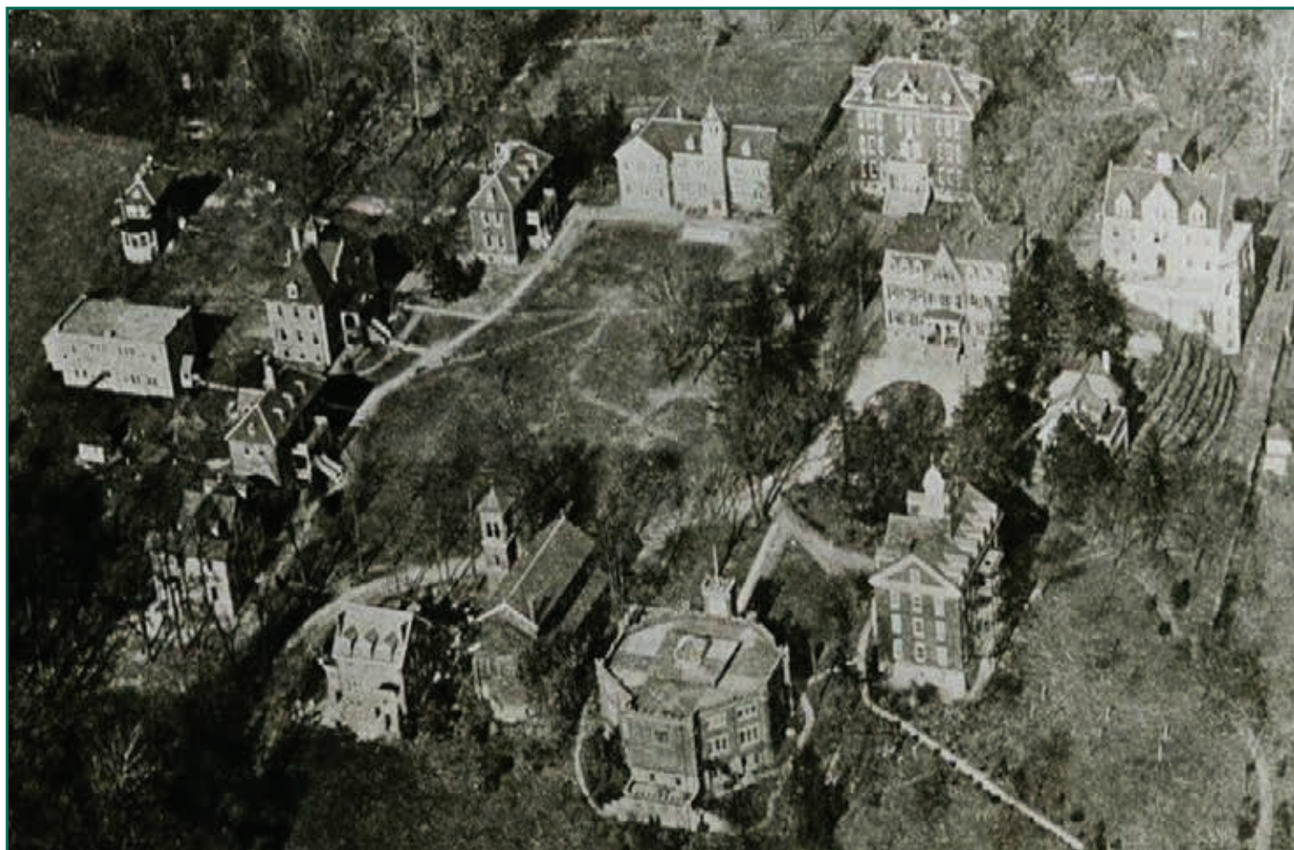
Aerial view of The Wartburg Orphans' Farm School 1923.