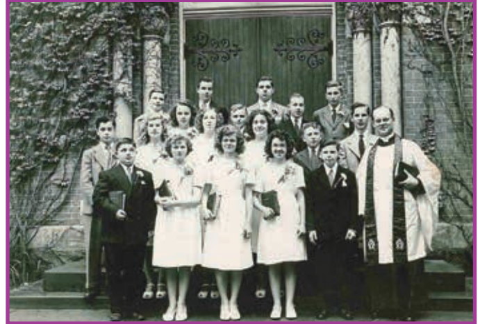
Deeply rooted in its Lutheran heritage, young adults were confirmed before leaving Wartburg.

Our Home Care team develops a specialized plan tailored to meet the individual needs of those we care for. Supervised by our experienced nursing staff, and in partnership with the individual's personal physician, we provide assistance with activities of daily living including personal care, dressing, meal preparation, housekeeping and home safety. We also provide individualized health care plans that may include professional nursing services; physical, occupational and speech therapy, as well as nutritional guidance; companion services for medical appointments, shopping and recreation; bath, breakfast and tuck-in services.