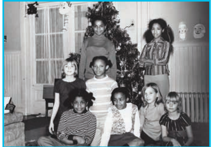
The Wartburg Orphans' Farm School's goal in caring for children was to create a real home for children in need of a safe environment. Children were housed in homes by age and gender, as reflected in the Christmas photo above taken in the "young girls home."

As the children went out into the world and lived their lives, in their later years they returned "home" to Wartburg. We were one of the first senior care providers, opening our first senior residence in 1897. For the next 82 years, Wartburg would remain home to both children and seniors alike – providing an "intergenerational environment" for all those living within the community. In 1979, Wartburg ceased its program of caring for children after 113 years.