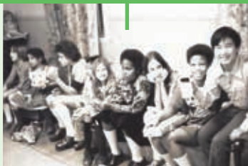
Wartburg ends its program of caring for children after 113 years.