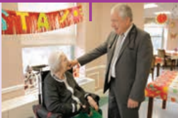
Wartburg breaks ground for new 160-bed skilled nursing facility.