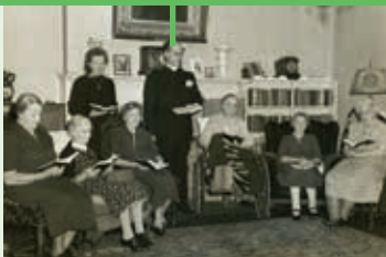
Skilled nursing facility built providing 80 beds.