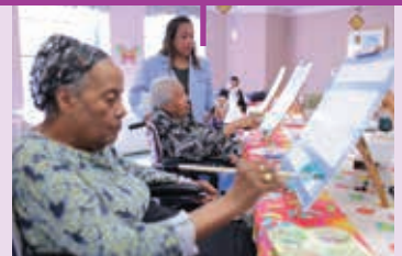
Council for Creative Aging & Lifelong Learning is launched.