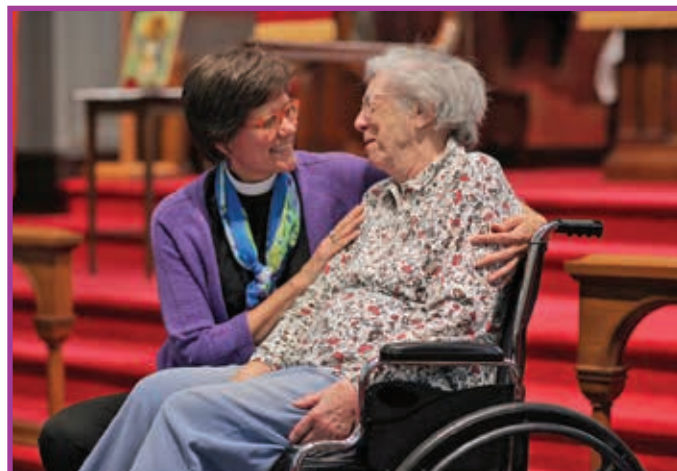
Wartburg's Spiritual Care continues to be at the heart of our mission today – serving individuals of all faiths.

The social model provides stimulating socialization and recreational activities for individuals in a professionally supervised environment, while the medical program is designed for those requiring health support services, in addition to enriching social activities.