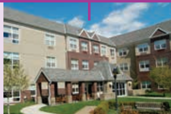
Meadowview Memory Care Center cares for those with dementia.