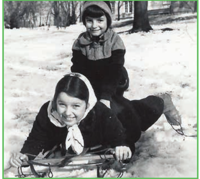
Wartburg's campus provided children the perfect environment for outdoor play and exercise no matter what time of year.

Wartburg's Inpatient/Outpatient Rehabilitation Programs are dedicated to supporting each person's individual needs. Our professional and experienced staff provides rehabilitative care focused on maximizing the independence of every patient by providing an intensive, customized treatment plan for a speedy recovery. Our goal is to get each patient home and back to their lives as soon as possible.