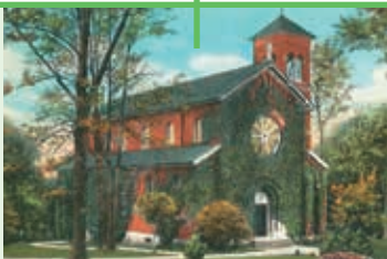
Wartburg Chapel is built through church donations.