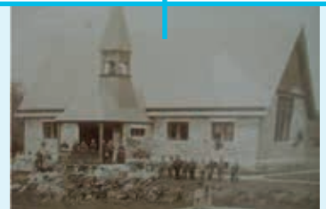
Charles Hauselt donates funds to build chapel/school.