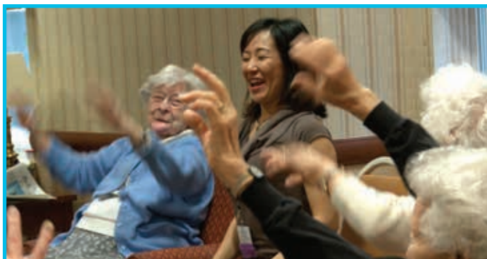
Music expresses that which cannot be put into words and that which cannot remain silent for residents of Wartburg's Meadowview Memory Care Unit.