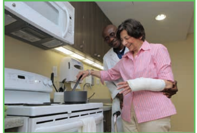
Wartburg’s Next Step Home Apartment enables patients to re-learn functional living skills before returning home.

In September 2015, Wartburg’s Outpatient Rehabilitation Clinic opened as the newest therapeutic initiative offered through Wartburg’s continuum of care. The clinic is designed to meet a patient’s individualized needs with state-of-the-art equipment, personalized treatment, and innovative therapies to maximize their recovery. The clinic offers a full range of Occupational Therapy, Physical Therapy and Speech-Language Pathology services in addition to Physiatrist services to treat musculoskeletal conditions. Care begins with a complete assessment of the patient’s illness or injury, development of a customized rehabilitation plan to meet their goals, establishment of progress monitoring metrics and assignment of private treatments scheduled at their convenience.