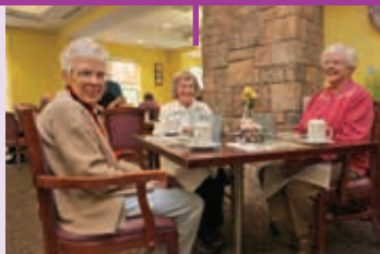
Meadowview Assisted Living opens, expanding senior residential services.