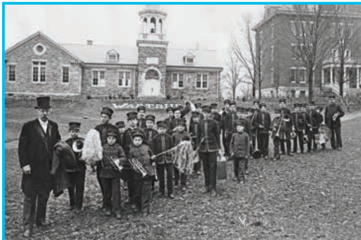
The Wartburg Boys' Band traveled extensively – bringing the gift of music wherever they went.