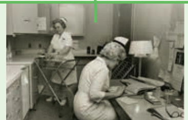
Infirmary built on campus to provide specialized senior care.