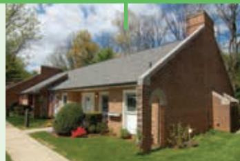
Lohman Village opens, providing 31 townhouses for senior living.