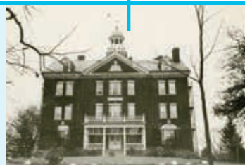
Mary Louise Heins Memorial Home for the Aged is introduced.