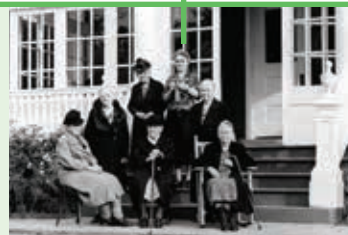
Senior home expands to meet demand for older adult care.