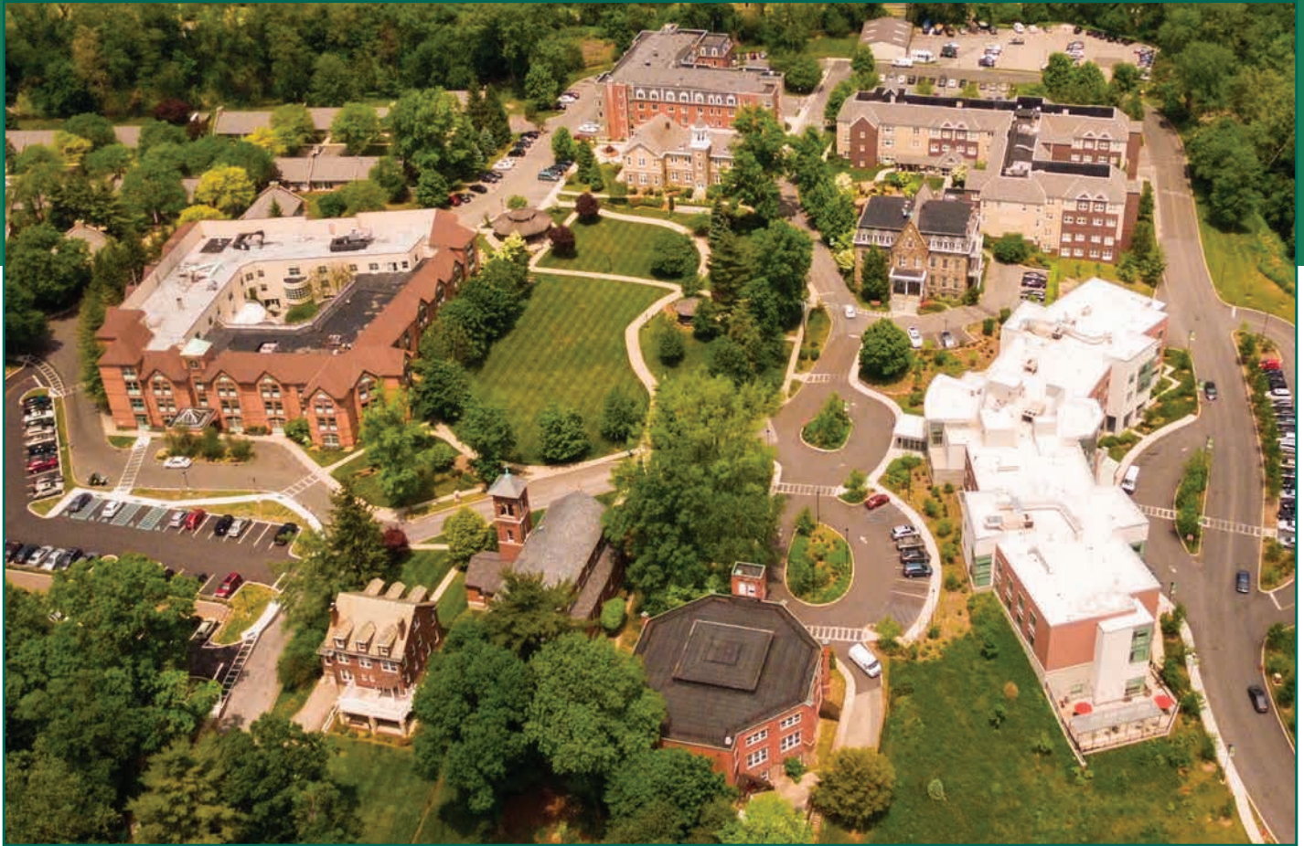
Aerial view of Wartburg 2016.

Today, Wartburg continues the legacy of caring created 150 years ago as a senior residential and healthcare provider. This tradition is made possible by the benevolence of our donors, who today continue to sustain our mission.