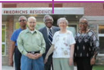
Friedrichs Residence opens, providing affordable senior housing.