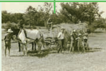
Farm on campus provides meals for 430 children & 40 adults daily.