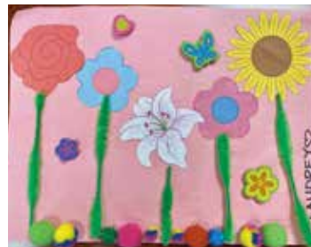
Drawings of Encouragement by the kindergarten and fifth grade classes of Milton School in Rye, NY, to Wartburg residents.