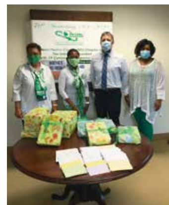
The Westchester County Chapter of The Links, Incorporated donated lunch for staff, cards with well wishes for residents, and Facebook portals for residents to use while communicating with their families.