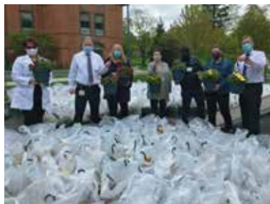
Flowers donated to residents by Lowe's Home Improvement and provided by CK Greenhouses of Cheshire, CT.