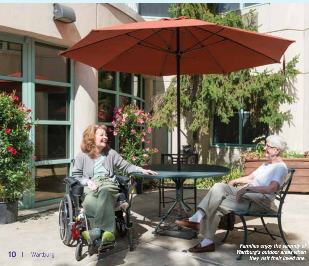
Families enjoy the serenity of Wartburg's outdoor areas when they visit their loved one.