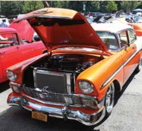
July 30 Car and Motorcycle Show