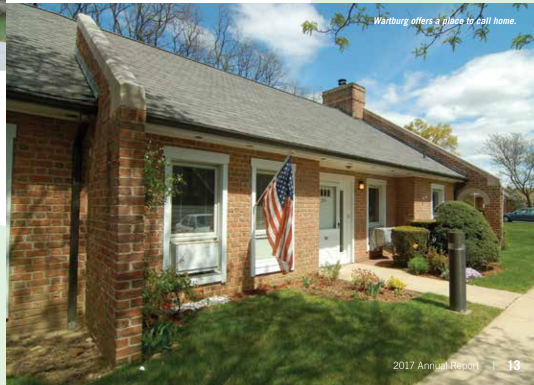
Wartburg offers a place to call home.

Vice President of Residential and Home Care Services and Wartburg staff member for over 14 years.