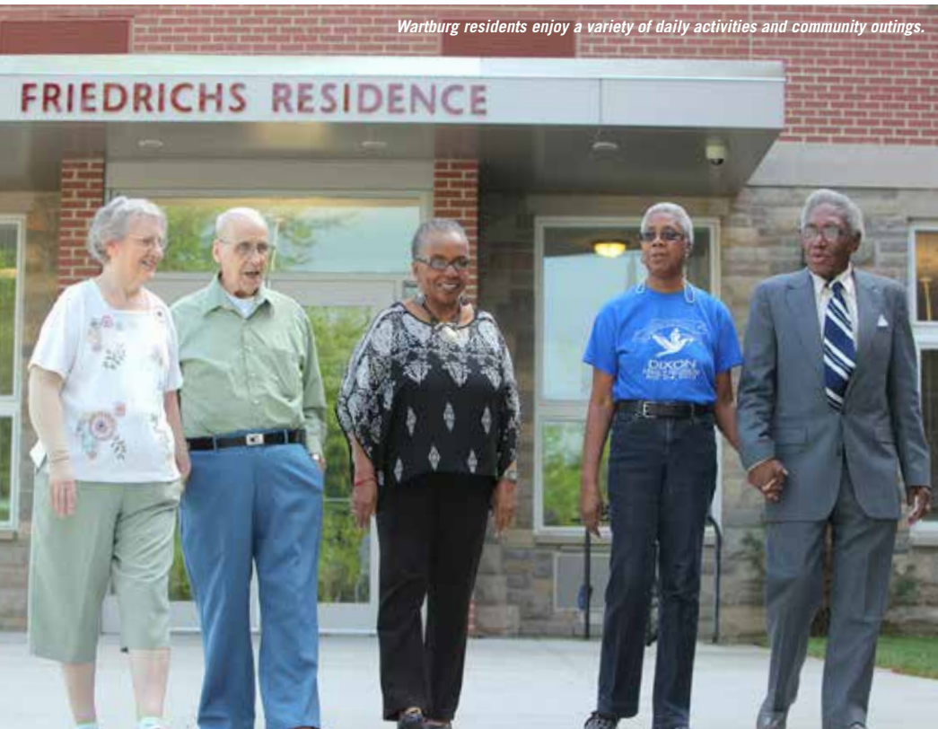
Wartburg residents enjoy a variety of daily activities and community outings.

Living independently at Wartburg offers the comforts of a retirement community on a rental basis, in a secure gated, community. There are no entrance fees or long-term commitments. Comforts include;