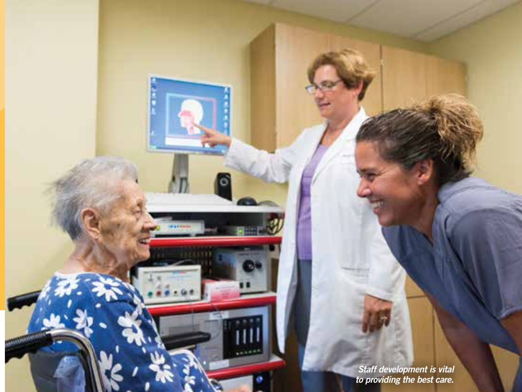
Staff development is vital to providing the best care.

Your continued support ensures Wartburg will be able to carry on our mission for years to come and persist in providing the best care possible for you and your loved ones for generations to come.