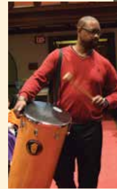
December 9 Creative Aging Winter/Spring Concerts