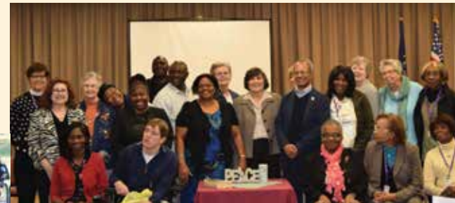
November 7 Spiritual Care Training Completion Ceremony