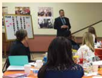
April 25 LeadingAge New York IGNITE Leadership Academy