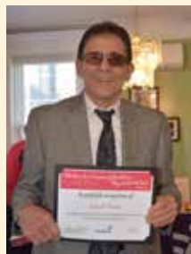
February 14 Volunteer Recognition Event