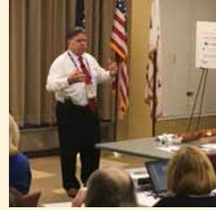
November 2 Long Term Care Seminar