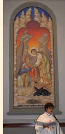
November 5 Chapel Icon Dedication