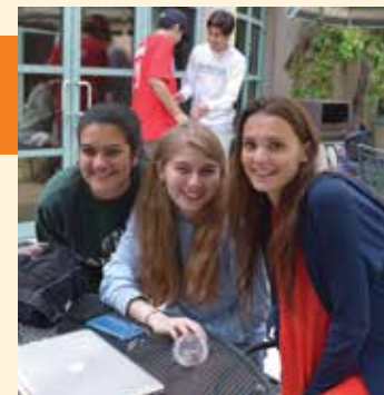
May 23 Bronxville High School Service Day