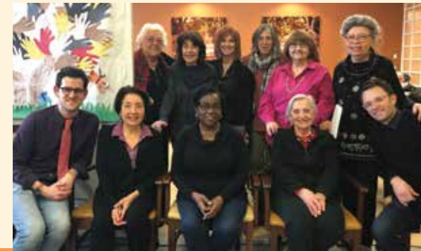
December 19 Adult Day Services Improv Show