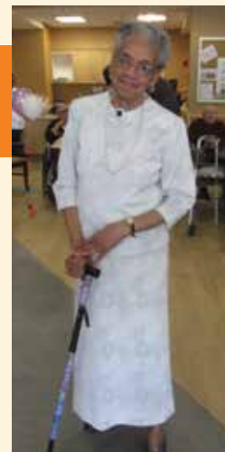
May 12 Adult Day Services Mother's Day Fashion Show