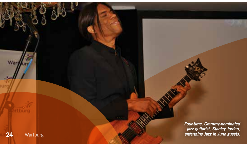
Four-time, Grammy-nominated jazz guitarist, Stanley Jordan, entertains Jazz in June guests.

Proceeds from the 2017 Jazz in June gala helped Wartburg purchase an indoor Smart Car for its Rehabilitation Center and helped support Wartburg's internationally recognized, award-winning Creative Aging & Lifelong Learning initiative by hiring a Creative Arts Therapist who will provide classes that offer Wartburg residents stimulating arts-based programs such as dance therapy. The Smart Car, installed in 2018, allows patients the opportunity to comfortably re-adapt to transferring in and out of a motor vehicle, a necessity for achieving independence.