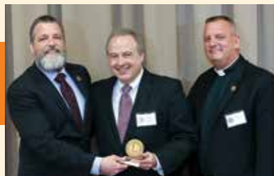
April 19 Passavant Society Luncheon