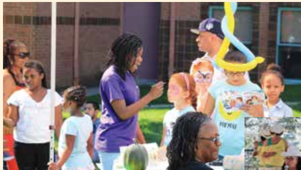
September 23 Fall Festival