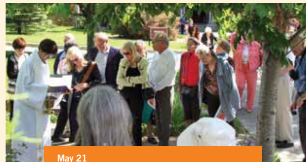
May 21 Service of Prayer and Remembrance – A Celebration of Life and Blessing of Legacy Gifts