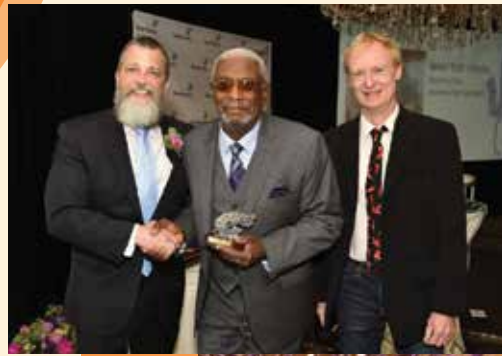
June 15 Jazz in June Gala