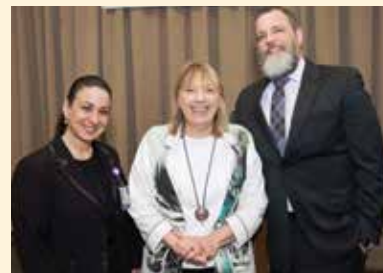
May 11 Essentials of Estate Planning Seminar