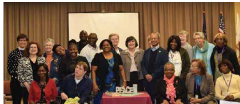
Spiritual Care Visitor graduates

Working collaboratively with our spiritual care partners, Wartburg is a satellite Clinical Pastoral Education site offering theology students the opportunity for interfaith professional education for ministry to our residents and patients. Across the United States, Wartburg is a Recognized Service Organization affiliated with the Evangelical Lutheran Church in America and recognized by the Lutheran Church – Missouri Synod.