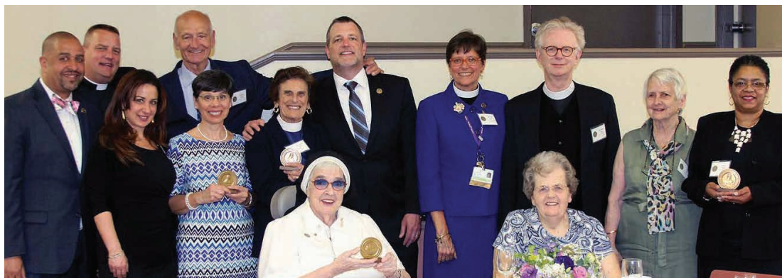
▲ Passavant Society members join together in celebrating Wartburg's 150th Anniversary at the annual Passavant Society luncheon.