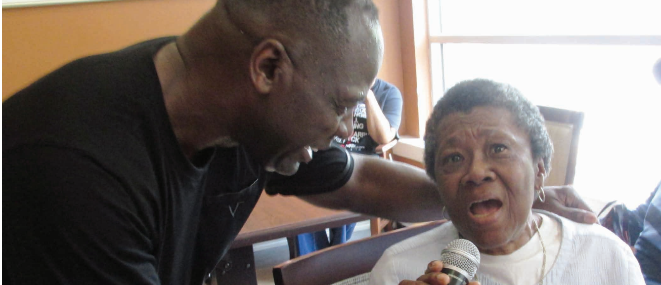
▲ Celebrating music together!