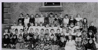
The Wartburg Orphans' Farm School accepted children of all religions and nationalities.