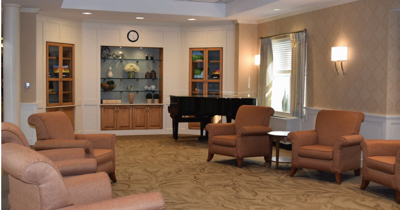
▲ Meadowview Assisted Living Gathering Lounge.