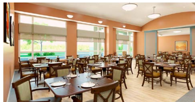
New Rehabilitative Center, opening September 2013