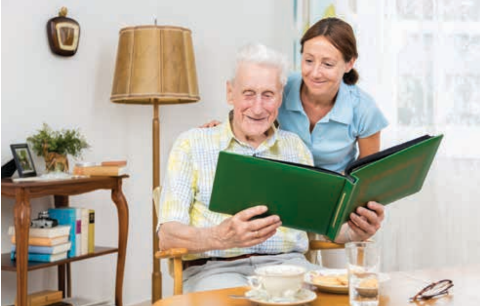
Wartburg's home health care approach means we are here for your every need.